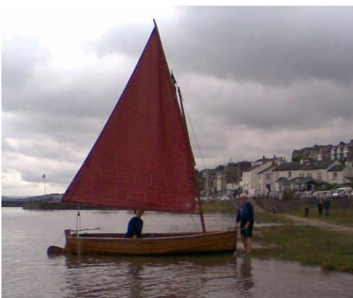
Peggy Blackett, a replica of Coch-y-bonddhu at Arnside, August 2018