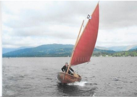
Griff Rhys Jones sailing Coch-y-Bonddhu