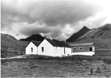
Dr Barnado's Adventure Centre, Camusrory